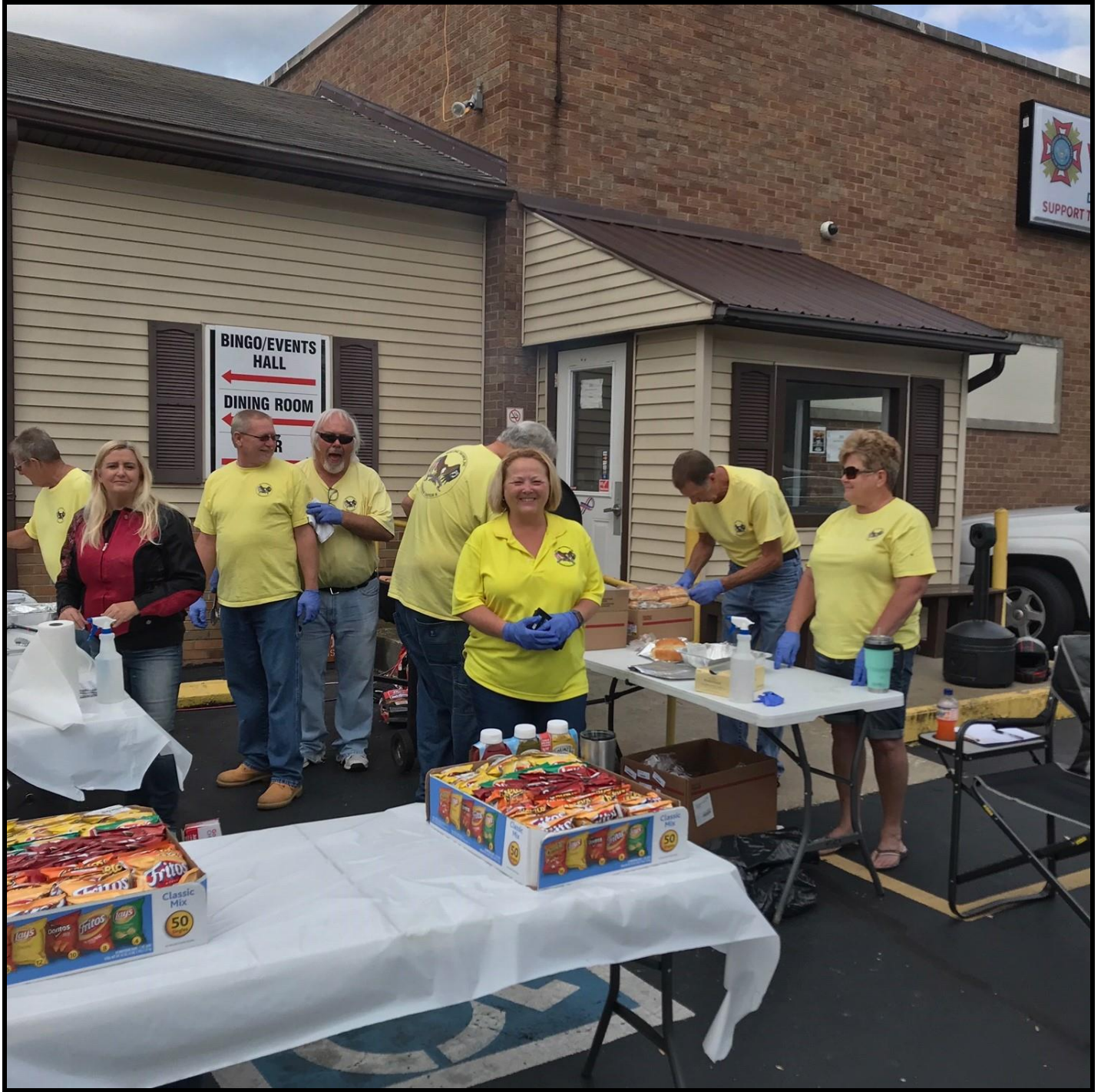
Patriots 5K Race July 4 th 2019