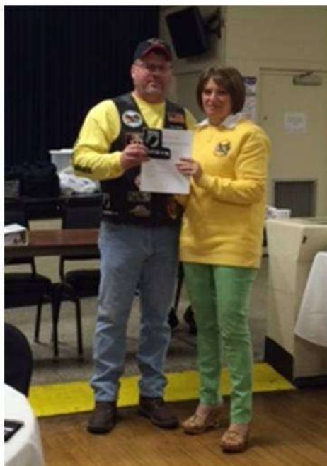
Michelle Tanner Boot Patch