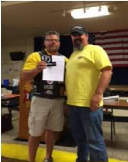
Mike Like Boot Patch